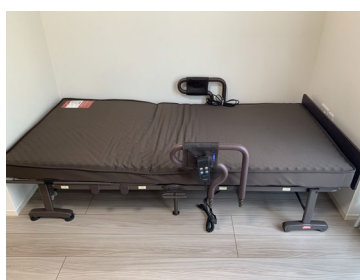
④ Electric bed